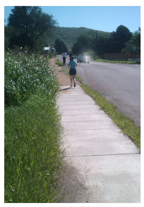
Runner in Alpine