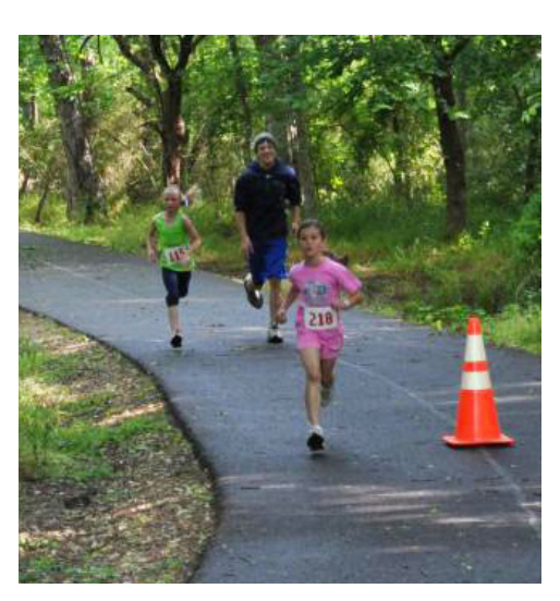
Youth marathon on an existing section of the NE Texas Trail.

Ensure the long-term integrity and sustainability of the 53-acre Headwaters Sanctuary, which includes