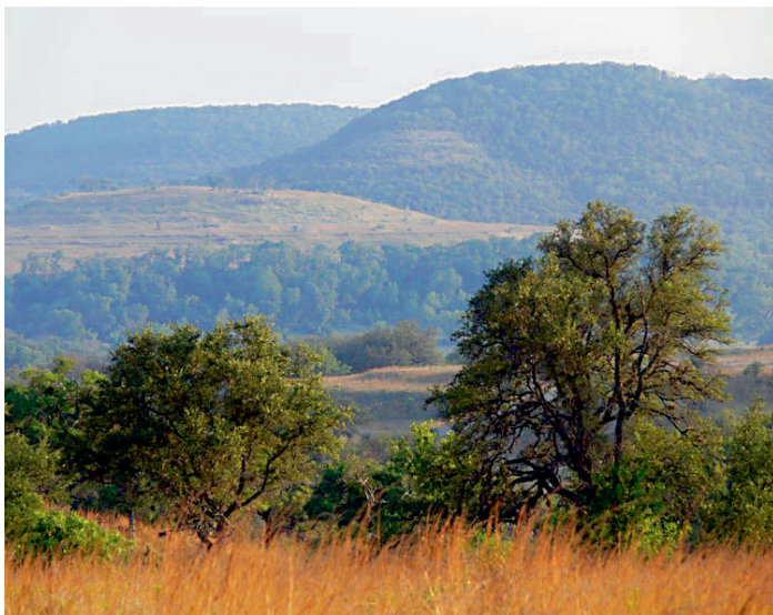
The Texas Hill Country region, with its fragile natural resources, is experiencing rapid population growth. County governments must have the tools and revenue to plan for its future economic vitality.

Incompatible industrial and commercial land use threatens neighboring property values and negatively impacts residents