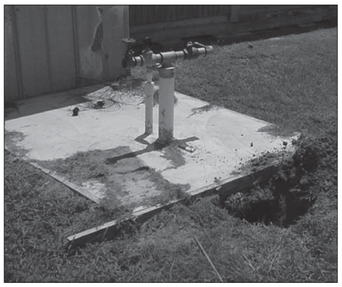
Figure 4. This well has a proper slab construction, with the casing extending well above the slab.