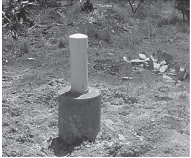
Figure 5. This well has a PVC cap and metal sleeve pipe protection.

• Periodically check the cap for cracks or evidence of tampering.