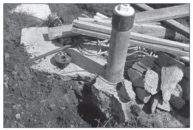
Figure 1. The slab around this capped well must be repaired to keep water from entering the well bore hole.

You can inspect the condition of a well casing at the surface by searching for holes or cracks. Use a light to check the inside of the casing. If you can move the casing around by pushing against it, the casing is probably deteriorating. If you need assis-