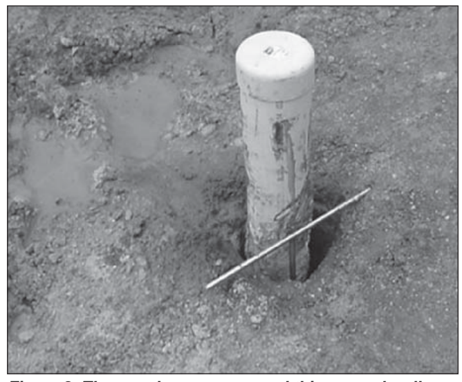
Figure 2. The annular space around this capped well must be properly sealed and a slab constructed around the casing.

http://www.license.state.tx.us/wwd/wwd.htm