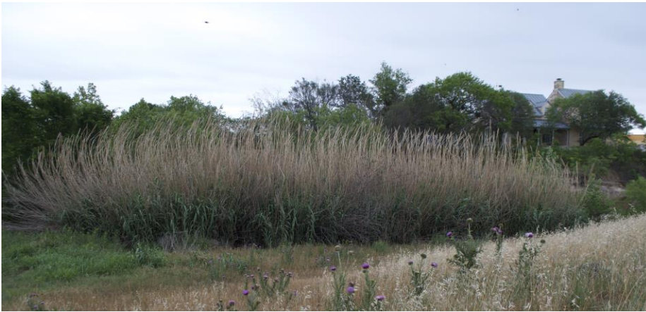
A large stand of Arundo donax welcomes visitors entering Fredericksburg on 290.

Those giant bamboo-type plants you've probably noticed in Barons Creek as you drive into Fredericksburg on 290 are a nasty example of a Texas Invader. Commonly known as Giant Reed or Carrizo Cane, this plants' scientific name is Arundo donax - and it can have serious consequences for our Hill Country rivers and streams. It grows at an alarming rate, displaces native vegetation, and can become so thick that it alters the natural hydrologic function of our creeks. On top of that, it is tough to get rid of! HCA is teaming up with the Nature Conservancy, TPWD and the City of Fredericksburg to educate landowners about dealing with this aquatic invasive. For more information, visit Pull.Kill.Plant or check out the recent article in the Fredericksburg Standard Radio Post.