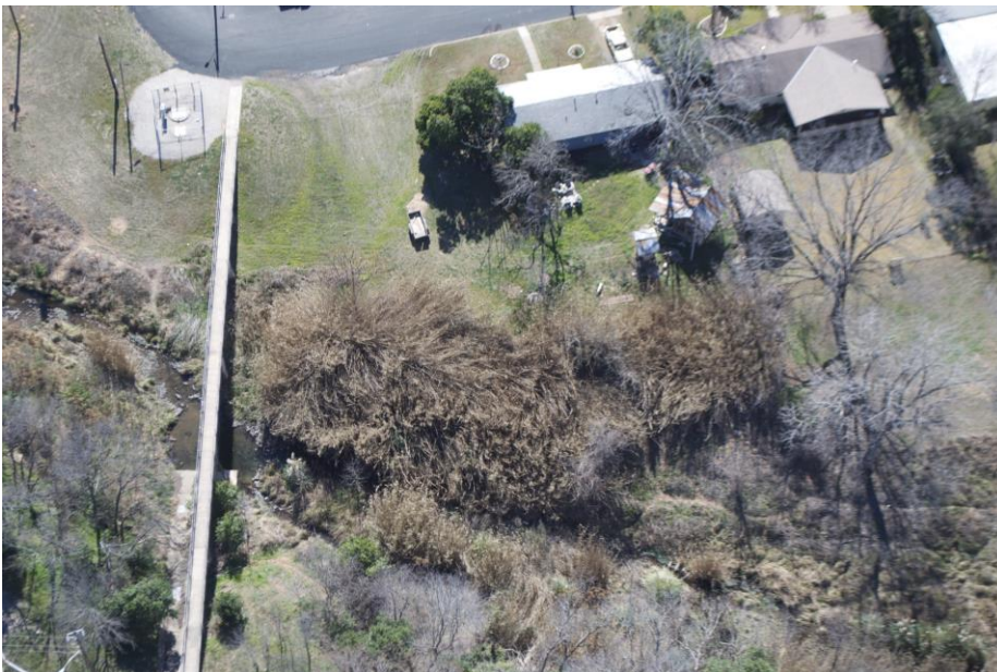
This image was taken from an aerial survey of Arundo in the Pedernales. More than 275 plants were identified- that number is likely to grow.