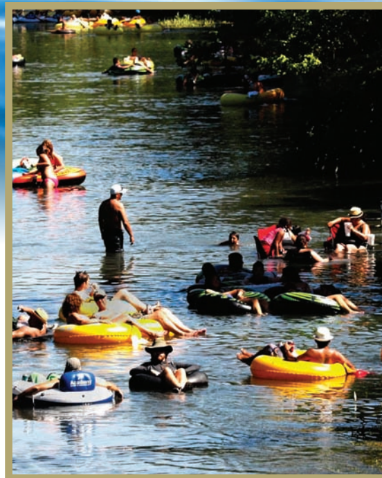
Photo by Austin Schniers was an entry in the 2011 Ranch & Rural Living Photo Contest. To enter the 2015 contest, see rules and entry blank on page 15.

Unless Rep. Larson is “speaking with a forked tongue”—and I do not feel he is—there is some logic to sharing our water, and to some extent we already do. We should be using carefully thought out plans when no or few other options are left . There are some pipelines and reservoirs on rivers which share water now. Some drier areas are maxed out now or will be soon.