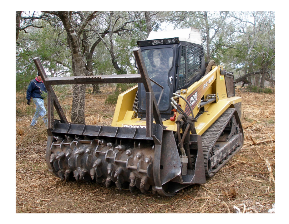
One type of forestry mulcher A steel drum is with cutting knobs is attached to a skid steer tractor, then turns at high rpms to shred a tree from top to bottom.

Hydraulic shears attached to skid-steer tractors (Bobcats) and forestry mulchers are other tools that offer more versatility on a variety of different sites and conditions (i.e. hills, dense woodlands, etc.) This method is effective on Ashe juniper trees because they do not re-sprout.