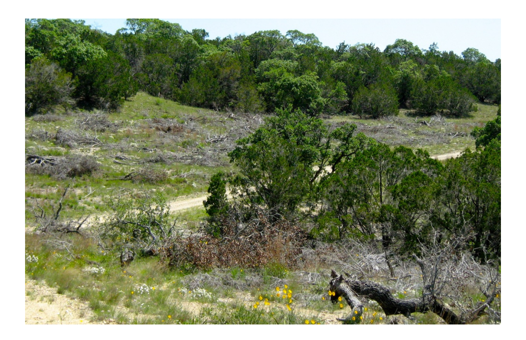
Slash or cut branches left on the ground instead of gathered into huge piles can hasten recovery, especially on slopes and hillsides.