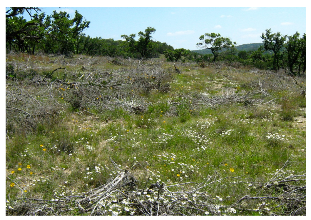
In the juniper blanket method, the branches are left on the ground to prevent erosion and serve as "nurseries" for new plant growth. After several years, a managed burn can remove the branches, or they can be gathered and burned in small piles.

reducing erosion, protecting new grasses and seedlings from browsing and from pounding rain, while adding organic material to the ground. This is called the "juniper blanket method".