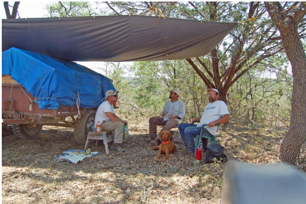
Supply wagon and tarp tent for lunch breaks

The Bobcat skid steer was purchased from Bobcat of Austin, while the Dymax tree shear was purchased from Holt Caterpillar of Austin. To avoid down-time due to maintenance issues, we take with us into the field the most common supplies and replacement parts, such as hydraulic hoses, fittings and couplers, extra shear blade bolts, fluids and filters.