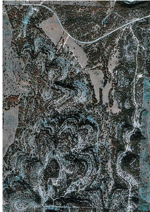
1995 aerial photo

Aerial photographs like the ones above were obtained from the Texas Natural Resource Information System [ https://tnris.org/ ] and helped to identify where thickets of oak-juniper woodlands historically existing on the Ranch. One general observation made from these images is that the densest woodlands on the ranch are found on the east side (right), especially in the tributary canyons and along the east fence line.