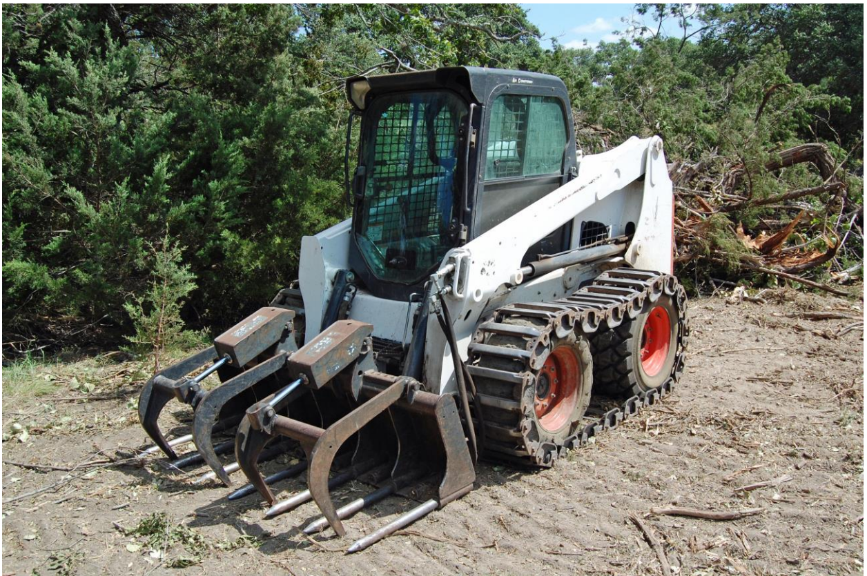
S630 Bobcat skid steer loader with foam-filled tires, steel tracks, and a tine-fork grapple http://www.bobcat.com/loaders/skid-steer-loaders/models/s630/features

Determining where and where not to thin is an important first step for any juniper thinning project. This determination drives the decision on which thinning method and type of equipment to use, such as mechanical vs biological control or bulldozer vs skid steer machinery. On the C.L. Browning Ranch, the shallow soils and steep slopes eliminated bulldozers as an appropriate option yet the density of juniper eliminated fire as a safe control method. For these reasons, skid-steer loaders and hand crews were selected as a responsible and effective way to thin the juniper. After testing all appropriate makes and models of skid steers and hydraulic tree shears, the 70 + horsepower Bobcat model and the 14" Dymax tree shear were determined to be most effective tools for project. The foam-filled tires and steel tracks significantly improved our stability and traction when operating on steep slopes.