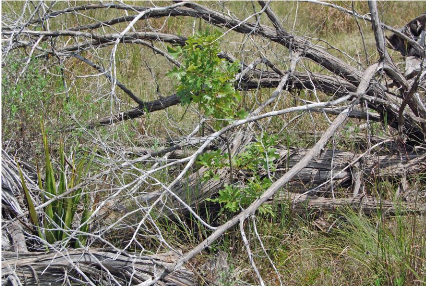
A Texas Red Oak growing through the branches of a cut juniper

Leaving the cut brush on the ground to blanket the site has produced several un-anticipated benefits. In addition to slowing down soil erosion and providing more moist and shaded conditions for grass growth, we have observed numerous desirable woody trees and shrubs growing under the branches of the cut juniper. Continued management of the White tailed deer density will help these woody species to mature. We have also documented an increase in the Bobwhite quail populations, especially in the areas where the brush was left on the ground.