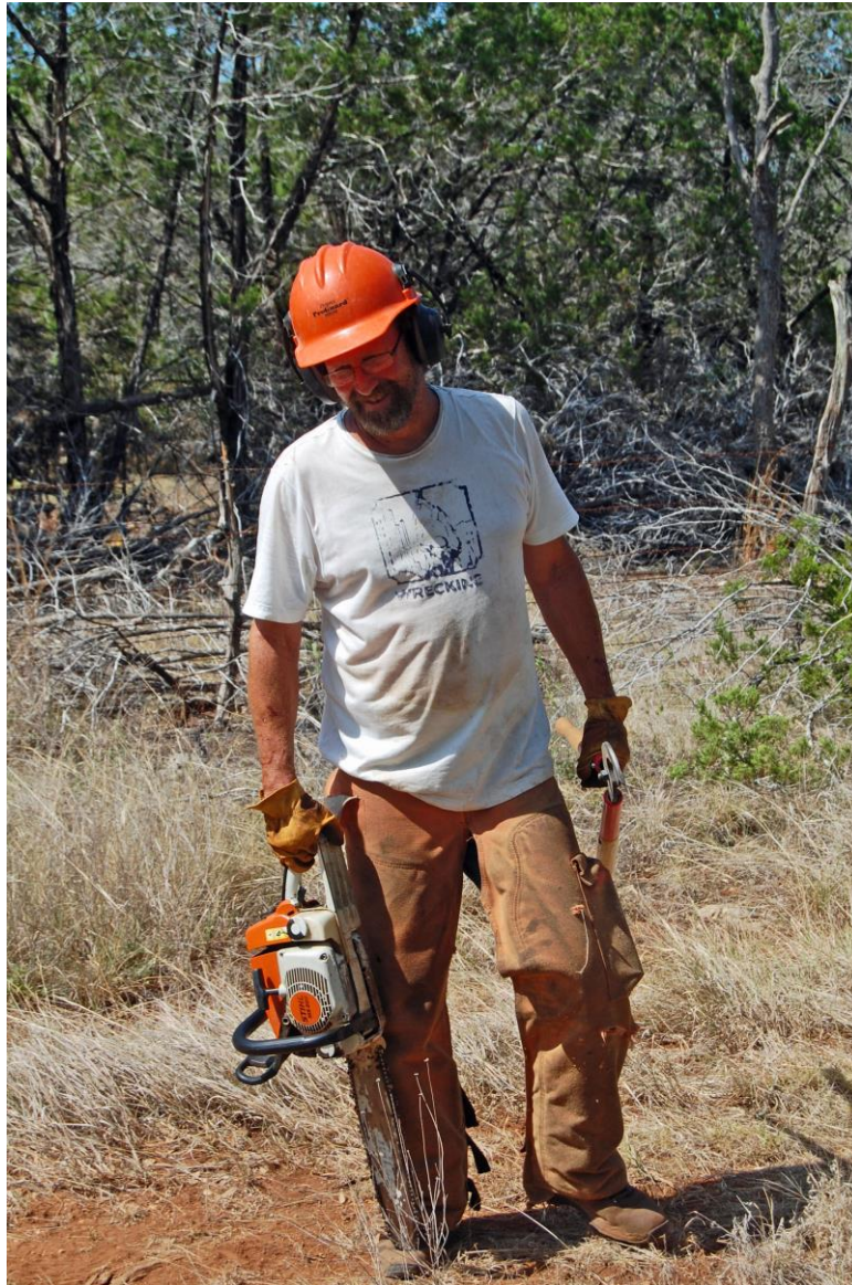
Hand Crew Essentials: Chaps, hard hat with ear muffs, eye protection, chainsaw, loppers, gloves, and good boots

The role of the hand crew during the C.L. Browning juniper thinning project was to work in the areas where the skid steer could not safely access, such as underneath oaks and elms, steep slopes, and near waterways. During a 2011 thinning project, a two-man ground crew following in the wake of skid steer was able to complete just under three acres per day. The list of field-tested equipment that worked for the C.L. Browning Ranch includes Stihl MS 261 chainsaws with 16 inch bars guiding Stihl yellow label .325" high-kickback chain, and Corona Super-Duty 32" loppers.