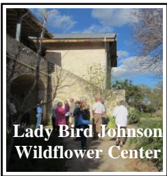
Lady Bird Johnson Wildflower Center