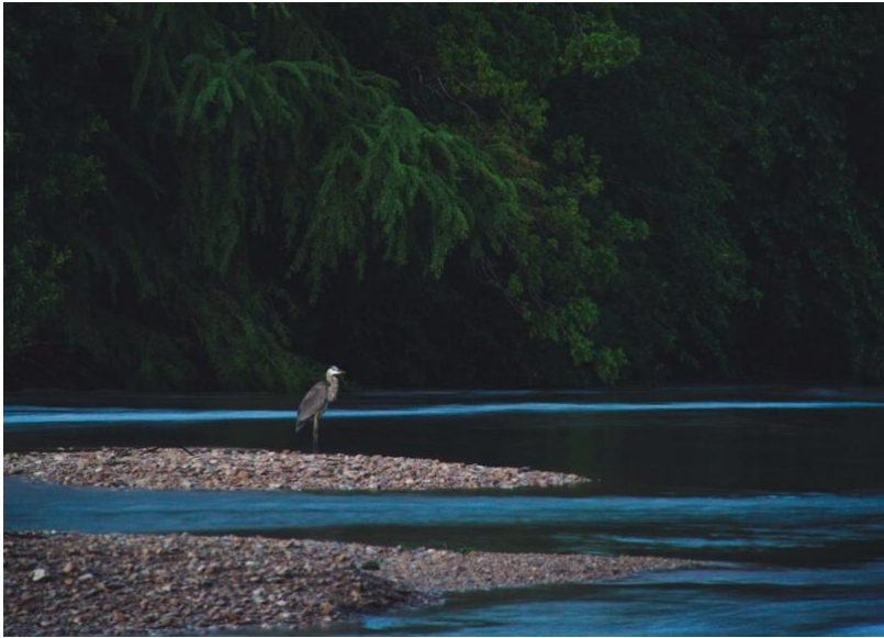
2019 winner "Hunter" by Mihail Mancas