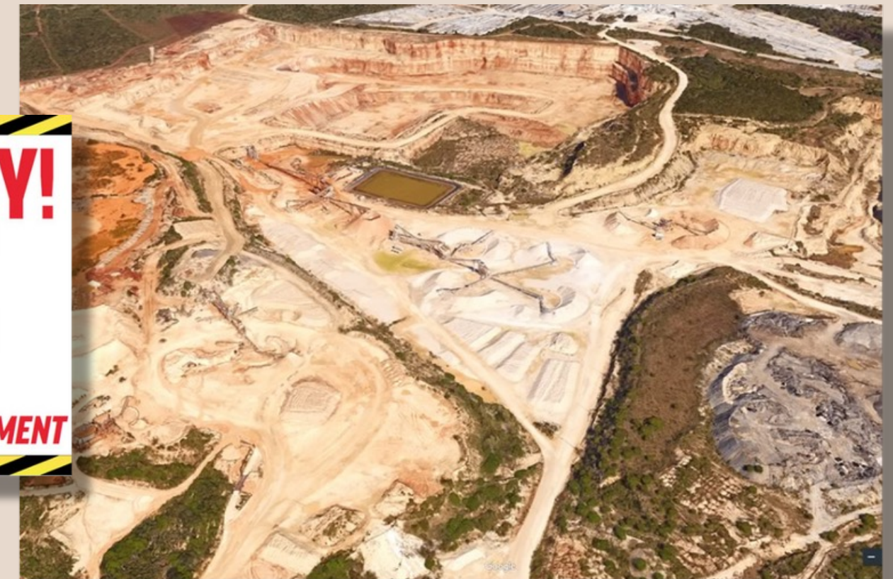
Vulcan Quarry in San Antonio

STOP VULCAN QUARRY! PROTECT YOUR FAMILY Stop3009VulcanQuarry.com GET INVOLVED NOW! SAVE OUR AIR, WATER QUALITY & OUR ENVIRONMENT