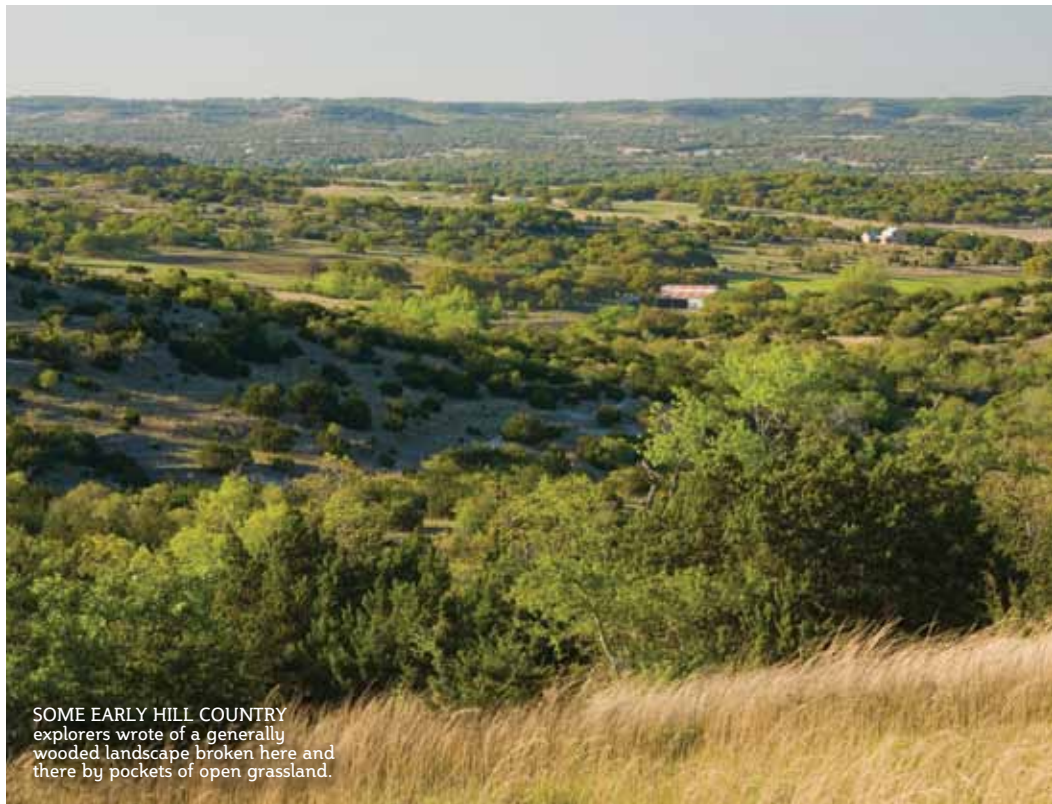
SOME EARLY HILL COUNTRY explorers wrote of a generally wooded landscape broken here and there by pockets of open grassland.

From the Miranda Expedition in 1756, describing conditions in the Guadalupe, Blanco, San Marcos and Pedernales river basins: "In all this region, there are no commodities nor anything except good