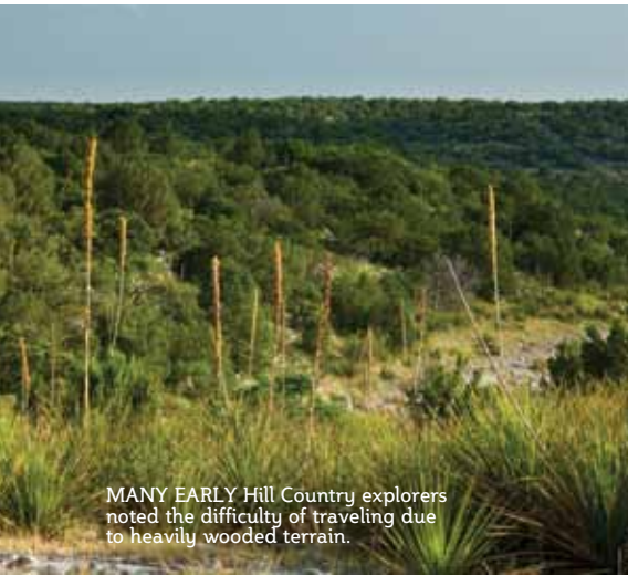
MANY EARLY Hill Country explorers noted the difficulty of traveling due to heavily wooded terrain.