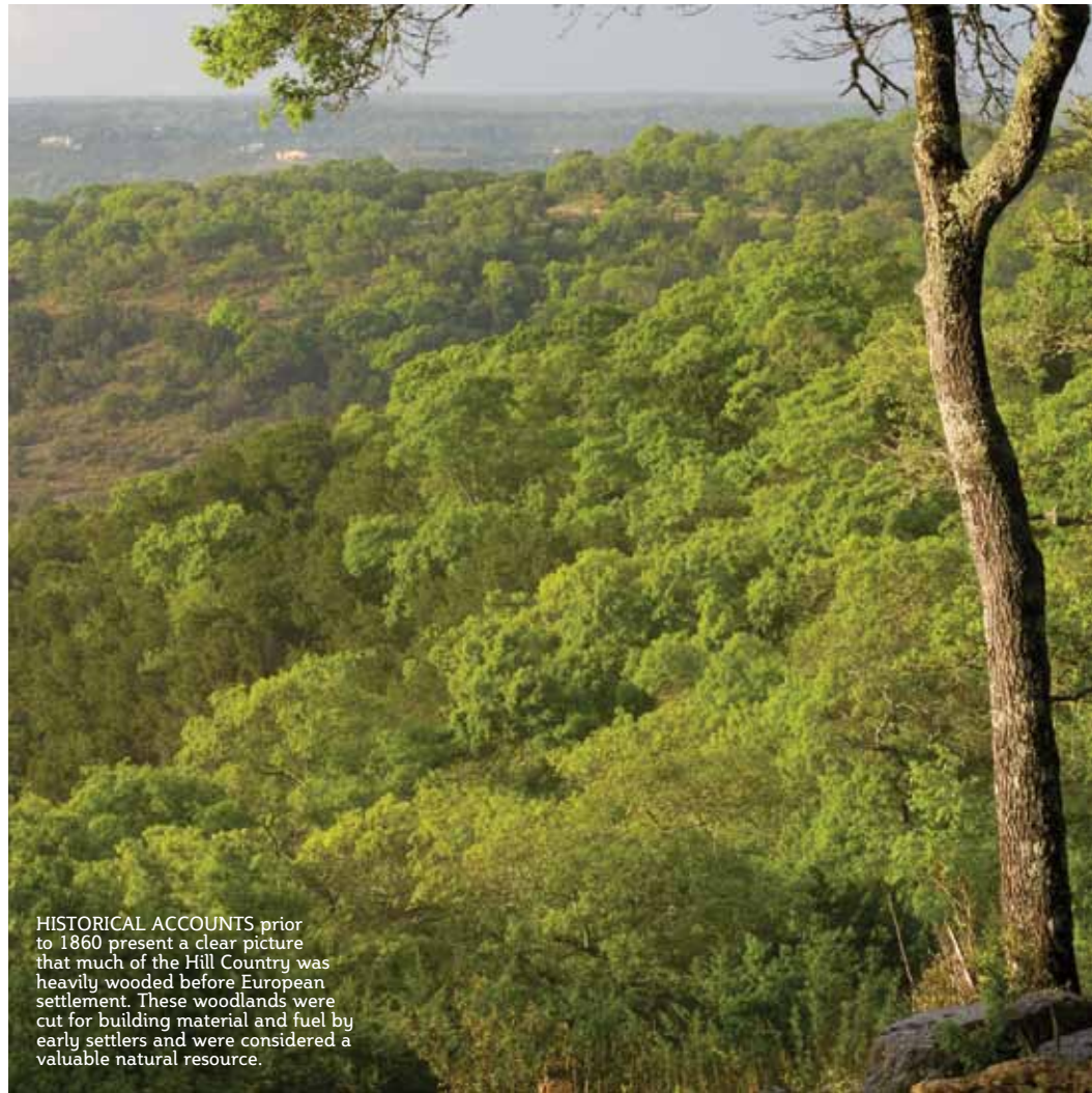
HISTORICAL ACCOUNTS prior to 1860 present a clear picture that much of the Hill Country was heavily wooded before European settlement. These woodlands were cut for building material and fuel by early settlers and were considered a valuable natural resource.

tentional twisting of the facts – they are sincerely believed by their proponents and often based on wishful thinking, tradition or hearsay.