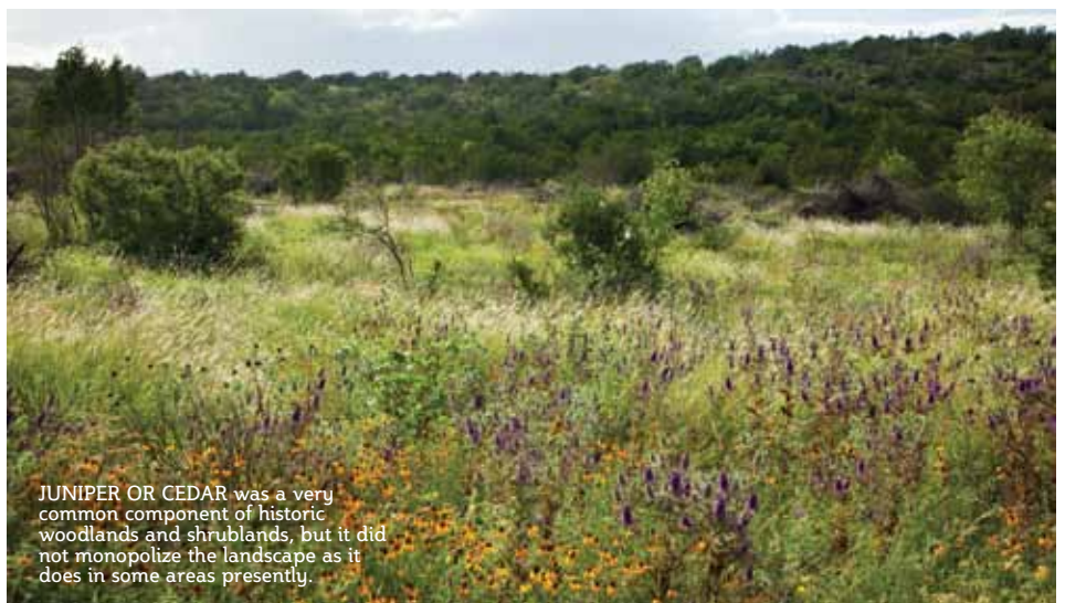
JUNIPER OR CEDAR was a very common component of historic woodlands and shrublands, but it did not monopolize the landscape as it does in some areas presently.