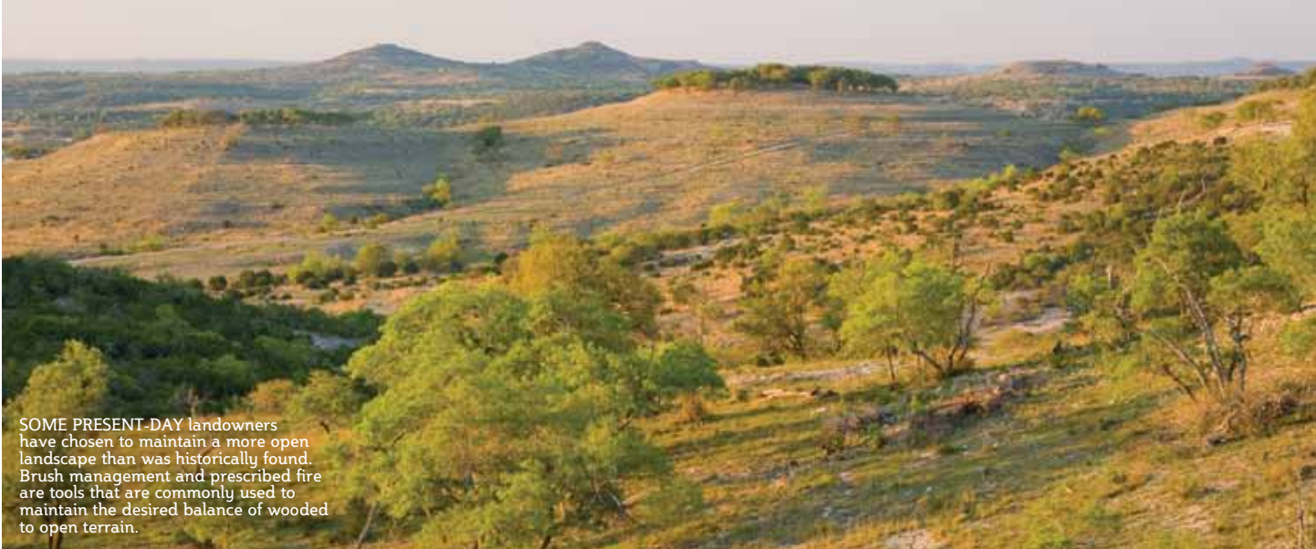
SOME PRESENT-DAY landowners have chosen to maintain a more open landscape than was historically found. Brush management and prescribed fire are tools that are commonly used to maintain the desired balance of wooded to open terrain.