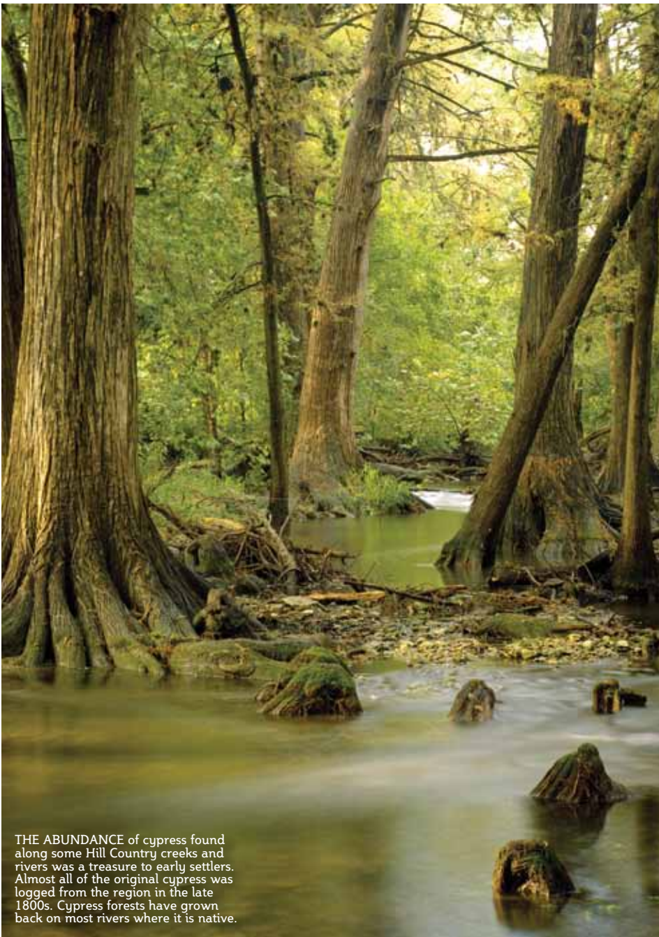
THE ABUNDANCE of cypress found along some Hill Country creeks and rivers was a treasure to early settlers. Almost all of the original cypress was logged from the region in the late 1800s. Cypress forests have grown back on most rivers where it is native.

the slopes exclusively, formed an impenetrable thicket through which a path had to be cut...The cedars here...are stately trees with straight trunks, seldom more than twenty or twenty-five feet in height and one and one-half feet thick...This cedar forest was a treasure to the colonists..."