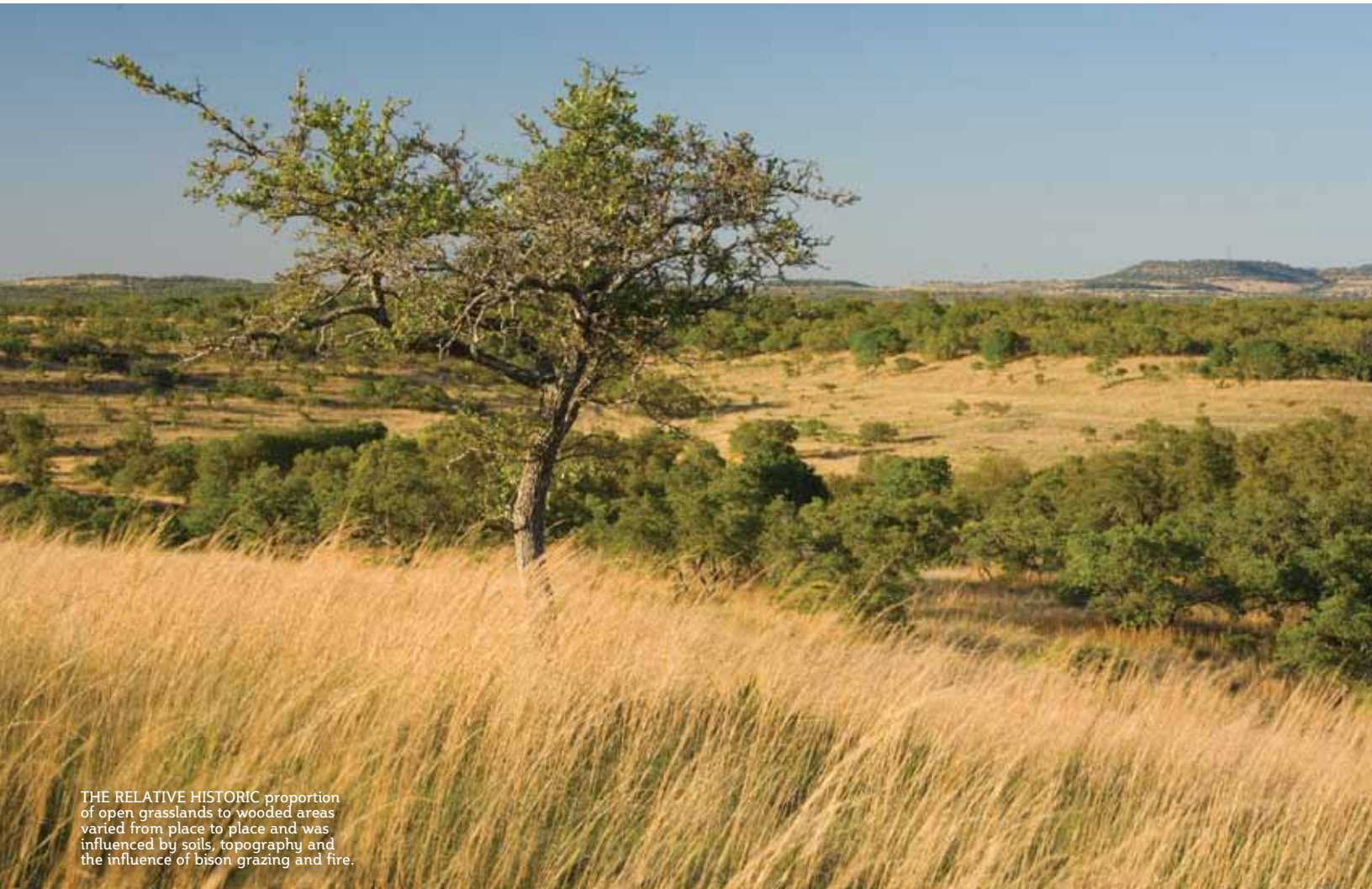
THE RELATIVE HISTORIC proportion of open grasslands to wooded areas varied from place to place and was influenced by soils, topography and the influence of bison grazing and fire.

He was able to see the big picture without some of the common biases that interfere with a clear understanding. One of his books, The Explorers' Texas: The Lands and Waters , contains an excellent chapter on the Texas Hill Country. This easy-to-read, well-documented chapter provides a convincing record regarding early Hill Country vegetation. The book is out of print but is available in many libraries. The following excerpts from this chapter provide ample support that much of the Hill Country was very well-wooded prior to the disturbances and landscape alterations of early settlers. It is important to note that these accounts are prior to 1860 when the early settlers began the widespread cutting of the woodlands of the region for building material and fuel.