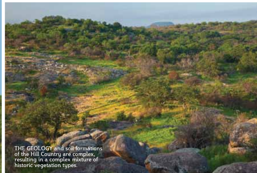
THE GEOLOGY and soil formations of the Hill Country are complex, resulting in a complex mixture of historic vegetation types.

Myths are not necessarily totally untrue. There is often a thread of truth woven into myths. This is what makes them believable and what helps perpetuate them. In fact, there is enough truth contained in some myths that they could simply be called misperceptions.