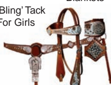
'Bling' Tack For Girls