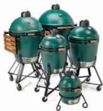
Big Green Egg Grills