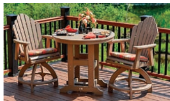
Berlin Gardens Outdoor Furniture