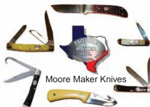
Moore Maker Knives