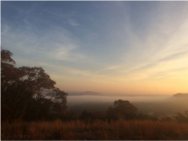
1 st Place – Jane Good