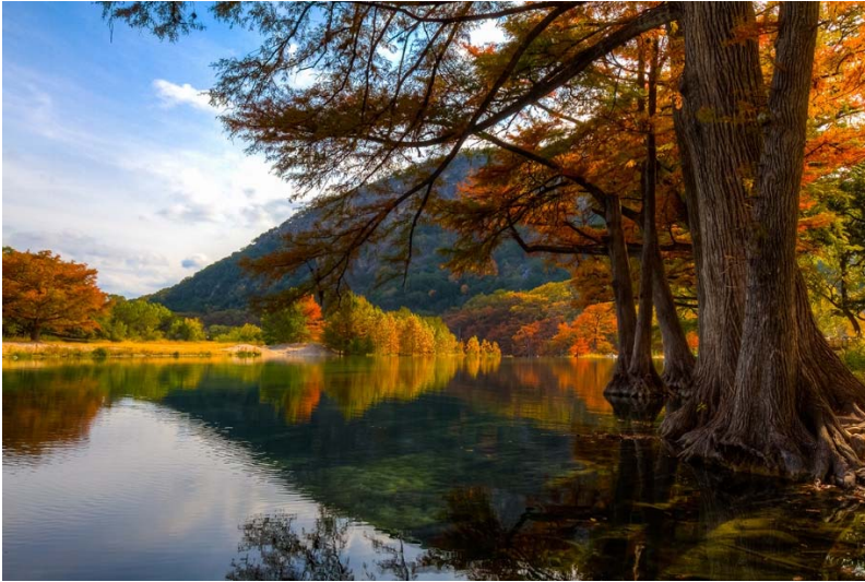
3 rd Place – Daniel Thibodeaux

(Full size, high resolution images available upon request)